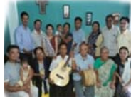
Hou-lhacha ho manchah dng Guitar leh khong kilam doh

2) Attended / participated at the monthly prayer meeting of KWS-Guwahati Pastors fellowship. This has been formed with the intention of maintaining cordial relationship among the Pastors of KWSG and ministries operating in Guwahati.